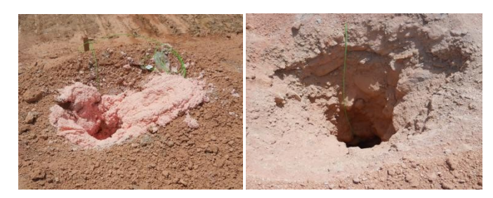
Figure 2 (L-R) Heavy ANFO after loading vs. ΔE after loading

TITAN 1000 \Delta E has excellent water resistance. As a result, it limits the amount of ammonium nitrate that can dissolve in run-off and groundwater. The Heavy ANFO bulk delivery trucks left roughly 6% of the total powder weight loaded around the collar, which makes it available to contaminate groundwater. TITAN 1000 \Delta E eliminated this problem with bottom up loading.